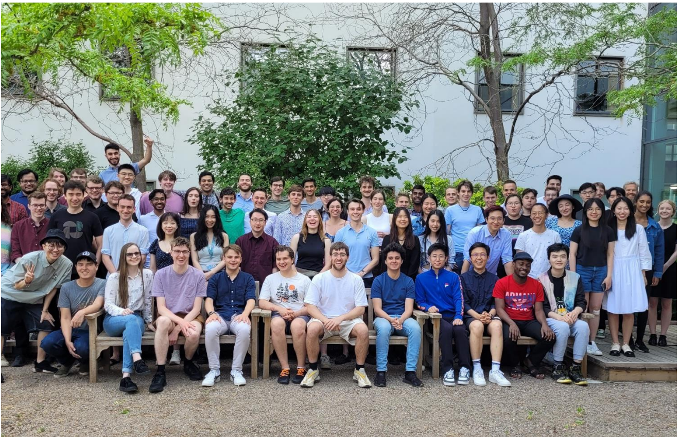
MPhil students 2022-23

Degree ceremony dates can be found at https://www.cambridgestudents.cam.ac.uk/your-course/graduation-and-what-next/degree-ceremony-dates . Note that not all Colleges present candidates at every date listed.