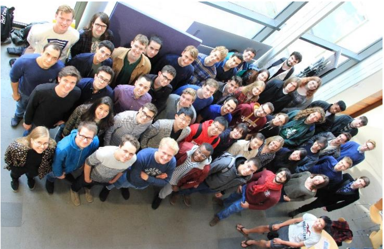
MPhil students 2019-20

Degree ceremony dates can be found at https://www.cambridgestudents.cam.ac.uk/your-course/graduation-and-what-next/degree-ceremony-dates . Note that not all Colleges present candidates at every date listed.