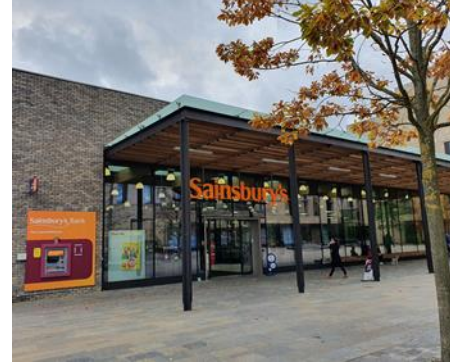
Sainsbury's Supermarket and ATM at nearby Eddington